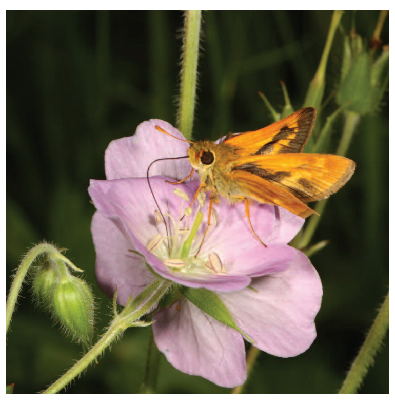
Long Dash ( Polites mystic ), 6/7/14, Newburyport, MA, Bo Zaremba