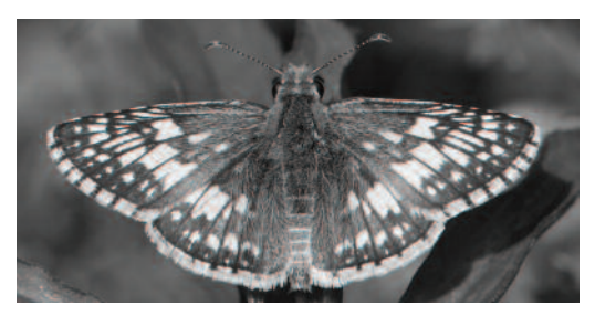
Common Checkered-Skipper ( Pyrgus communis), 7/17/14, Gardner, MA

Editor's Note: The Butterfly Count Program is administered by the North American Butterfly Association, 4 Delaware Rd, Morristown, NJ 07960. Official reports for all counts held in the U.S., Canada and Mexico are available from NABA for $11.00 for members, $16.00 for non-members, plus $2 S/H; request from naba@naba.org. The unofficial tallies for Massachusetts counts are reported here.