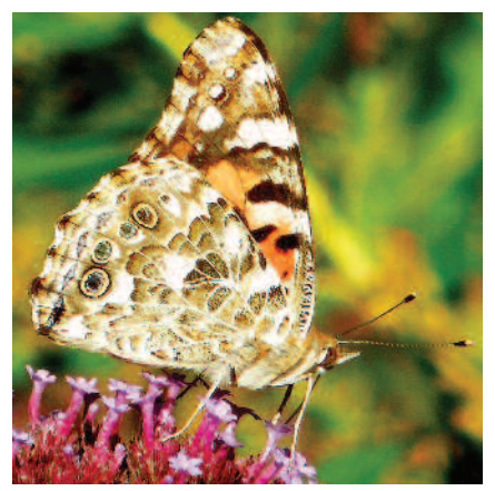
Painted Lady (Vanessa cardui), 9/26/14, Whately, MA