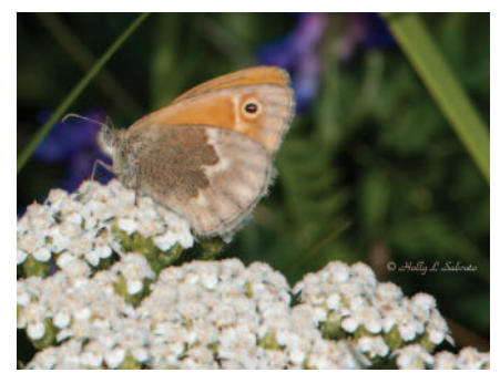
'Salt Marsh' Common Ringlet ( Coenonympha tullia nipisiquit ), 7/27/14, Carron Point, Bathurst, NB, Holly Salvato