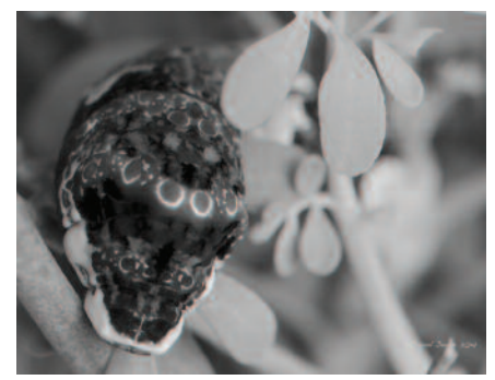
Giant Swallowtail caterpillar ( Papilio cresphontes) on Rue, Williamsburg, MA