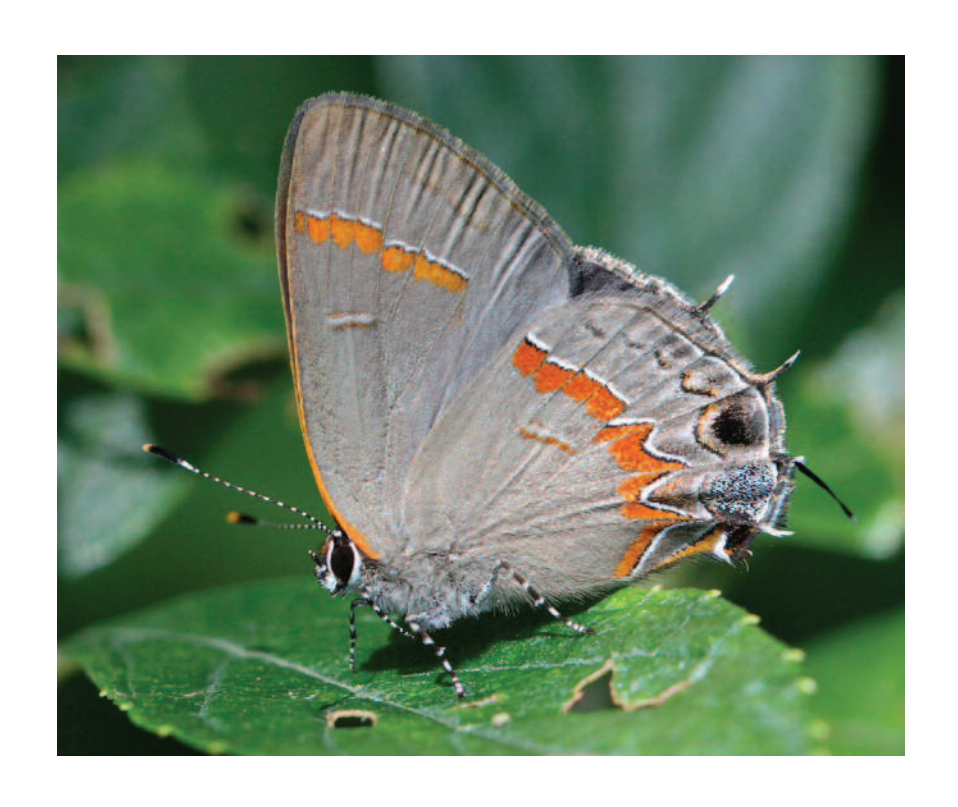
Fall 2014, No. 43