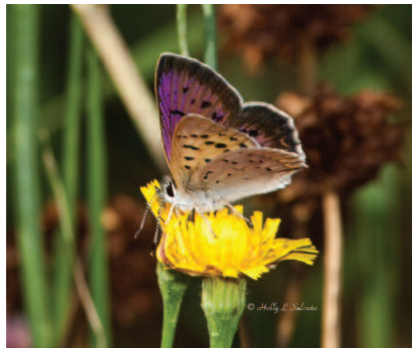
'Salt Marsh' Dorcas Coppers ( Lycaena dorcas dospassosi ), 7/27/14, Carron Point, Bathurst, NB, Holly Salvato. Males to the left and below left photos; below right photo shows male on the left and female on the right