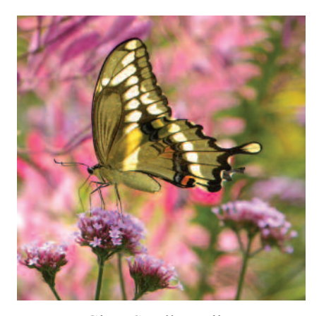
Giant Swallowtails ( Papilio cresphontes)