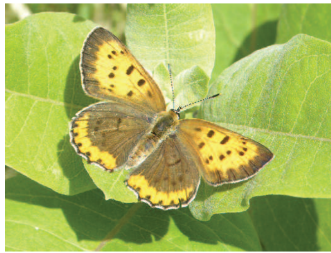
Bronze Copper ( Lycaena hyllus ), 6/8/10, Appleton Farms, Ipswich, MA, Howard Hoople

Bronze Copper ( Lycaena hyllus ), ventral view, 6/8/10, Appleton Farms, Ipswich, MA, Howard Hoople