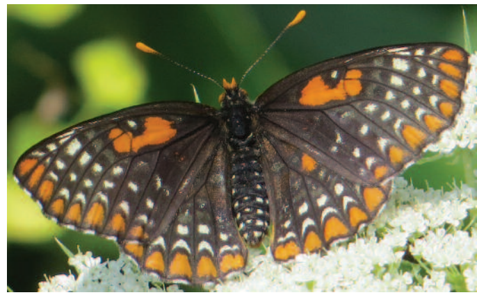
Baltimore Checkerspot (Euphydryas phaeton), 7/18/14, Woodsom Farm, Amesbury, MA