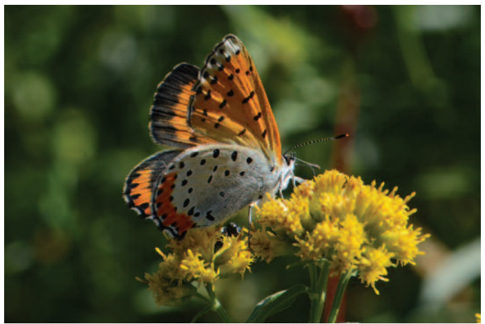
Bronze Copper ( Lycaena hyllus ), 9/23/14, Wayland, MA, Greg Dysart