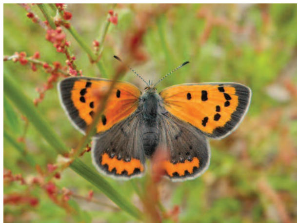
American Copper ( Lycaena phlaeas ), 5/11/14, Ward Reservation, Andover, MA, Howard Hoople