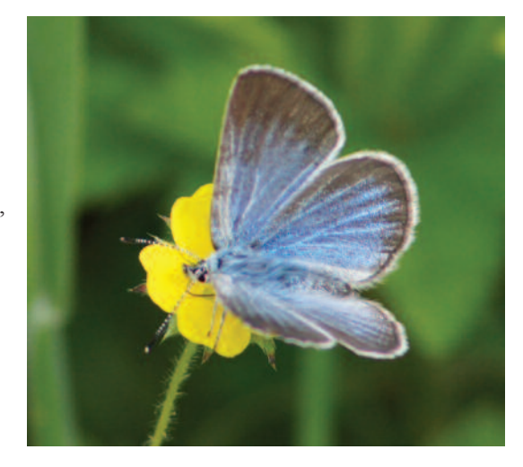
Silvery Blue ( Glaucopsyche lygdamus ), 5/26/14, Breakneck Hill, Southboro, MA, Dawn Puliafico