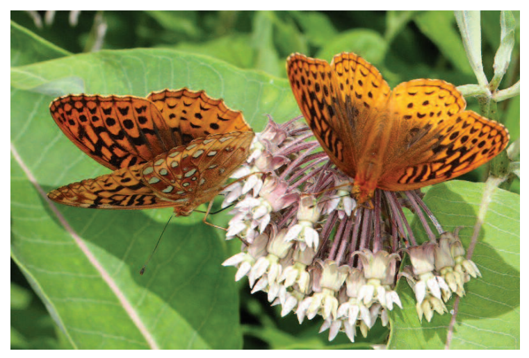
Great Spangled Fritillaries ( Speyeria cybele ), 7/5/14, Newburyport, MA, Bo Zaremba

Black Swallowtail ( Papilio polyxenes ), 7/20/14, Project Native, Housatonic, Great Barrington, MA, Dylan Cleary. Project Native is an excellent spot to buy butterfly plants, and to see the live butterfly house,