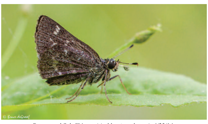
Pepper and Salt Skipper ( Amblyscirtes hegon ), 6/23/14, Broad Meadow Brook, Worcester, MA, Bruce deGraaf