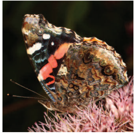
Red Admiral (Vanessa atalanta), 8/16/14, West Newbury, MA