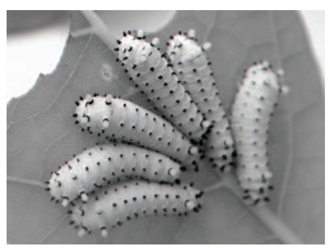
Promethea caterpillars ( Callosamia promethea ), 7/7/14, Project Native, Great Barrington, MA, Dylan Cleary