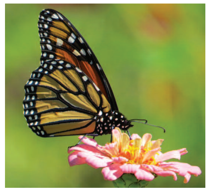
Monarch ( Danaus plexippus), 9/7/14. Amesbury Community Gardens, Amesbury, MA