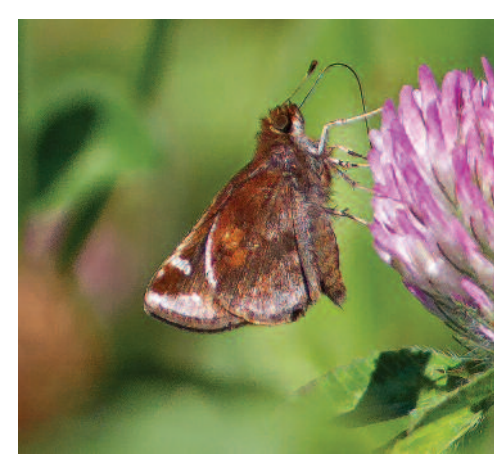
Zabulon Skipper female (Poanes zabulon), 8/22/14, Allens Pond, Dartmouth, MA, Erik Nielsen